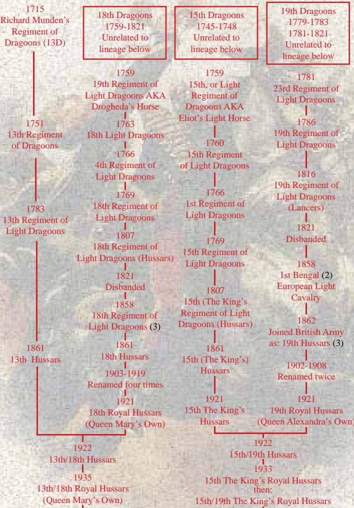
1992 The Light Dragoons