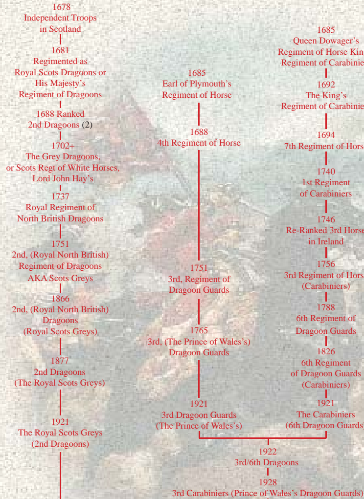
1971 The Royal Scots Dragoon Guards (Carabiniers and Greys)